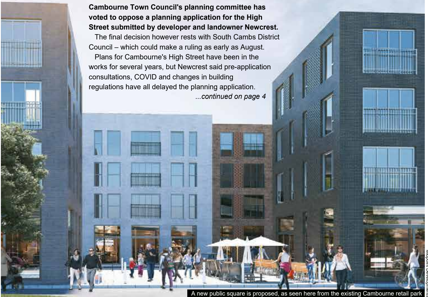
A new public square is proposed, as seen here from the existing Cambourne retail park