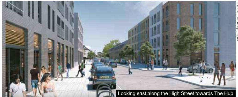
Looking east along the High Street towards The Hub

The Town Council's planning committee voted by a majority of just one in favour of