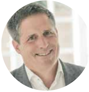
ANTHONY BROWNE MP FOR SOUTH CAMBRIDGESHIRE anthony.browne.mp @parliament.uk