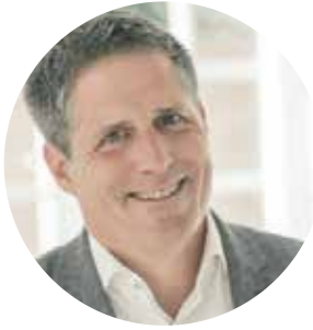
ANTHONY BROWNE MP FOR SOUTH CAMBRIDGESHIRE anthony.browne.mp @parliament.uk