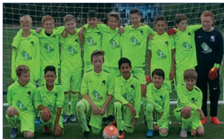
Cambourne FC's Under 13's Team (top) and Under 7's Whites Team (right)

Our Girls Football Academy (for 4 - 6 year-olds) is getting good numbers (Sat 9am - 10am, 3G pitch) but we still want more girls involved in the Academy, as well as in the 7 - 10 year-old age group (with Alex Minei). We are also proud to announce that we are starting a Women's Team that will start