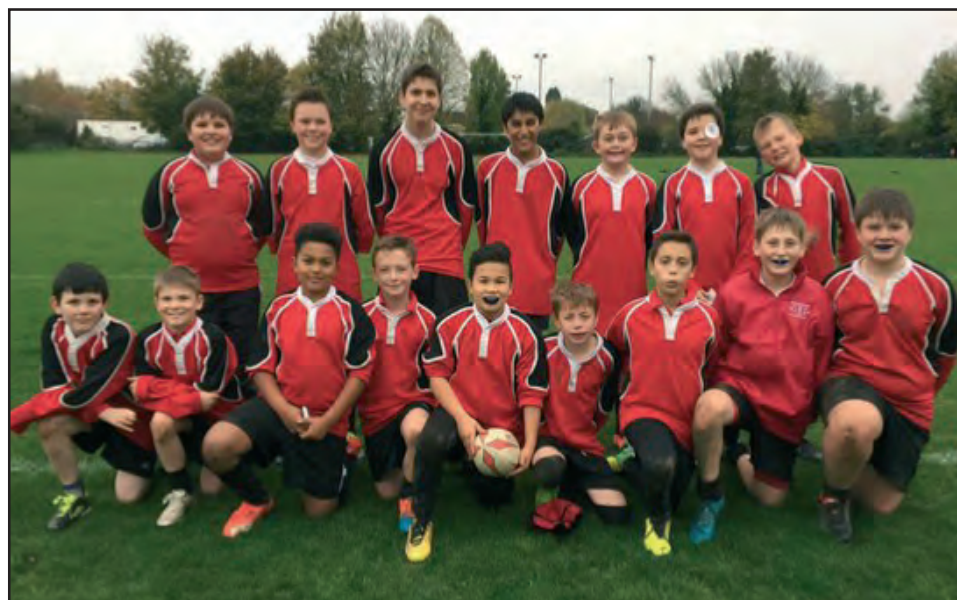
Proud new recruits to the Year 7 Hockey (below) and Rugby (above) teams

This has been against a backdrop of planning for the expansion of the College. With higher numbers of students than predicted coming up from our four catchment primary schools, we've been working closely with the design team to ensure that our facilities keep pace with our ambitions for the pupils. This means the addition of further Science labs and Design Technology workshops, further classrooms, more IT facilities, a larger library, and a purpose built - detached! – Music suite. A larger kitchen and extra dining space are included in the plans. We would dearly love also to build an all-weather sports pitch and an enlarged Performance Hall, and are exploring all options to see how these facilities, also of great value to the community, might be afforded, since they cannot be