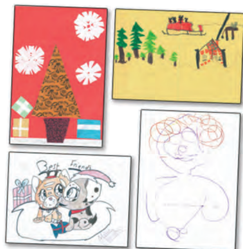
Last year's winning Christmas card design (top left) and runners up

The age group categories are: 3 and under, 4-5, 6-8, 9-11, 12-15