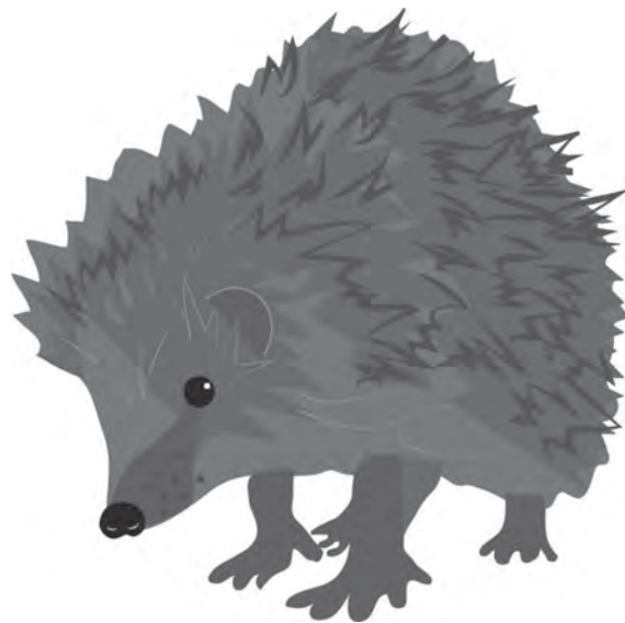
Illustration – Rachel Hudson

Find out more about Britain's prickliest mammal, and how you can help them. Lots of fun family activities, drop in event 10am-12noon. £2.50 per child, adults go free. Come to the Manor house, Broad Street, Cambourne, CB23 6DH. Please note there is no car parking available at the venue.