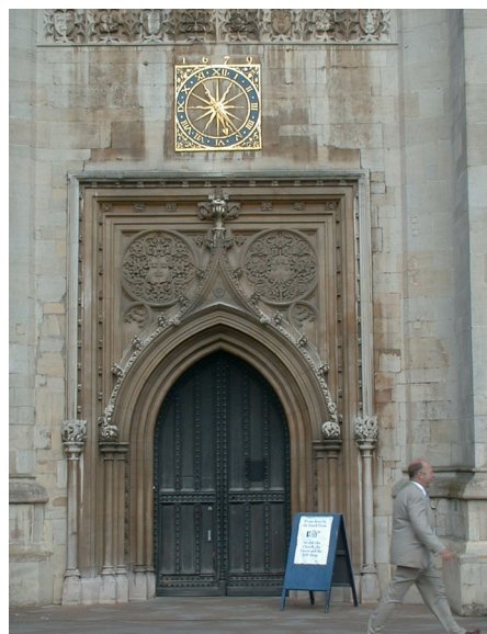
Great St. Mary's Church tower

This item first appeared in the Crier in September 2006