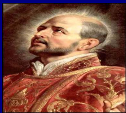
St Ignatius Loyola