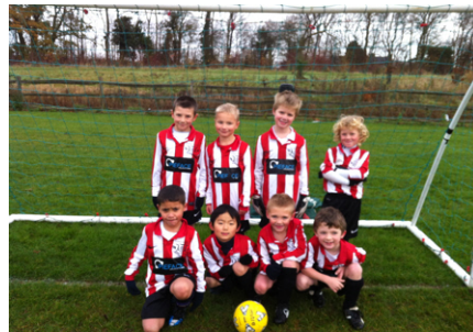
Cambourne Eagles U8 Red Team

U8 Blue - We have had our best run of the season so far, scoring a tremendous number of goals and keeping a clean sheet for the first time ever. The boys have been working really hard on their passing during training, leading to some really nice play, mostly at the opposition's end of the pitch. Happy New Year - let's hope it continues this successful spell for the team! U8 Red - Contact the club for details.