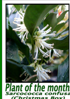
Plant of the month. Sarcococca confusa (Christmas Box)

Poinsettias are probably the most common indoor plant for the festive season. These brightly 'leaved' plants are from the euphorbia family, the sap inside is a milky white and can be a skin irritant to some people. They require average warmth not less than 55-60 degrees Fahrenheit. Place in a bright spot but not in direct sunlight or above a heat source. Let compost dry out moderately between watering. Wilting foliage can mean over or under watering, cold breezes or too much warmth. Misting occasionally can help. The flowers are yellow and develop on the stems near to where the coloured foliage grows. These plants should really only be counted as temporary decoration as getting them to survive, and re-colour, from year to year is a laborious task. I would say keep them for as long as they look good, then put them in the recycle bin.