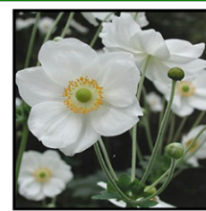
Plant of the month. Anemone hybrida "Honorine Jobert"

Things are beginning to get a little quieter on the gardening front, but there are still some jobs that require serious consideration. Frosts will soon be a regular occurrence so tender and half hardy plants need to be moved or protected. If they are in pots this is quite an easy job. As long as they are not huge pots. Move them to a more sheltered area of the garden, next to a house wall, out of then cold wind. A greenhouse is obviously ideal but a well lit shed/summer house will also do a good job. It is worth remembering that for your softer plants, such as geraniums, that you are trying to over-winter, an un-heated greenhouse may not provide enough protection. To help with this problem you could consider putting some fleece over them.