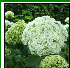
Plant of the month. "Hydrangea Annabelle"

Send your questions to The Green Man at greenman@cambournecrier.org