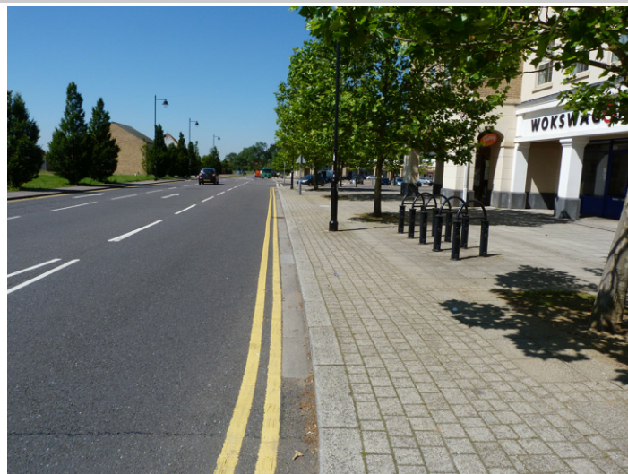
Double yellow lines laid in February

In a meeting with The Crier, representatives from a consortium of High St Shops expressed their concern over the impact on trade the traffic restrictions have had. The yellow lines, laid down in February of this year have undoubtedly improved the traffic and parking situation which had been a cause for concern for many Cambourne residents.