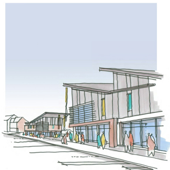
Sketch view along High St

Newcrest are clearly keen to involve local Cambourne residents and to keep you informed as the process unfolds. They have agreed to host a public exhibition on the morning of Saturday 9th June between 9am and midday, when there will be an opportunity to see their plans before a detailed application is made and to discuss these with both the developer and DLA.