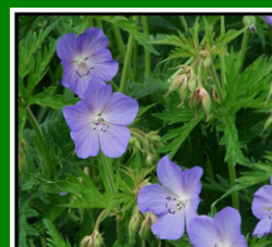
Plant of the month. Geranium pratense

Send your questions to The Green Man at greenman@cambournecrier.org