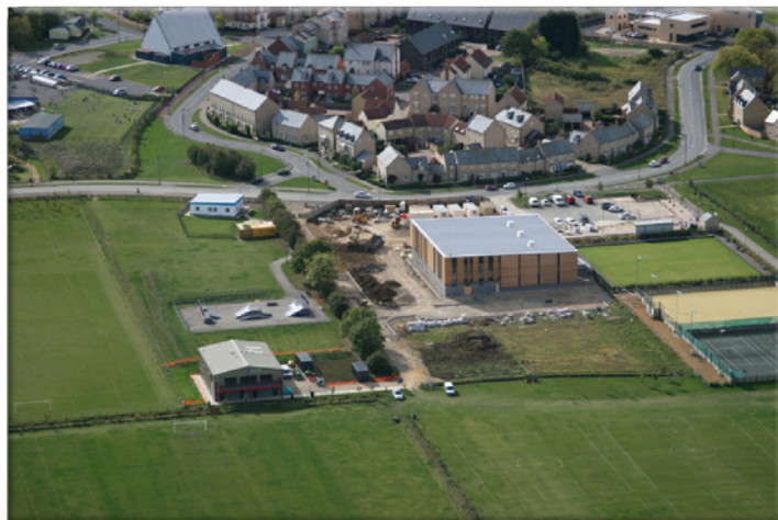
Above: Aerial view of Sports Centre construction site