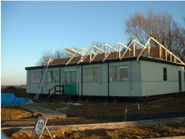
The Ark Under Construction - Early 2002