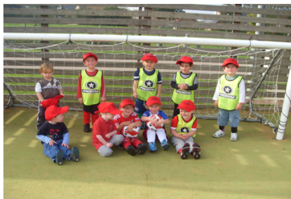
Cambourne Eagles Totballers