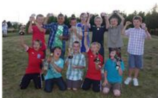
Eagles u10 squad

Trophy night was held at the beginning of July at the Cambridge belfry hotel. The night saw all the eagles children rewarded for all their hard work and commitment over the past season. The eagles committee organise extra fund raising events to ensure the children are given a really special night, a treat all the boys look forward to all year.